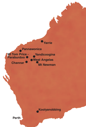
● Major iron ore mining projects and infrastructure centres in WA