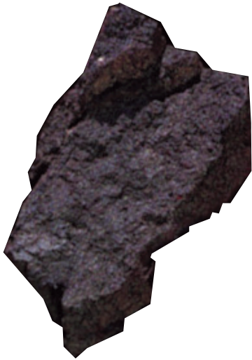
A raw iron ore sample