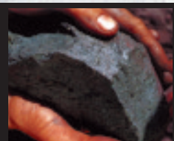
e - BHP Billiton Iron Ore