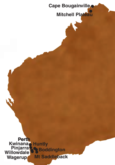
● Major bauxite mining and resource areas in W.A.